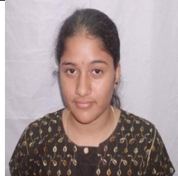
AMOGHA P FCD - ( 82 %)